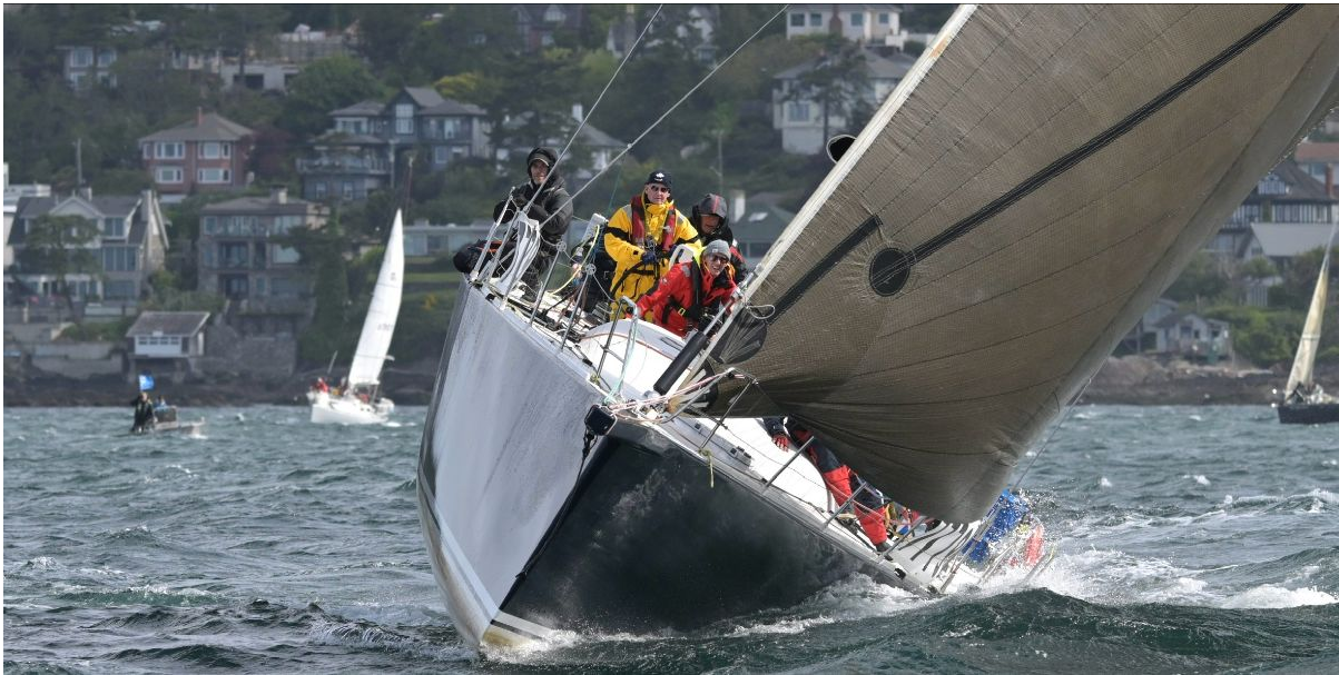
A yacht sailing in the Swiftsure race in 2024.