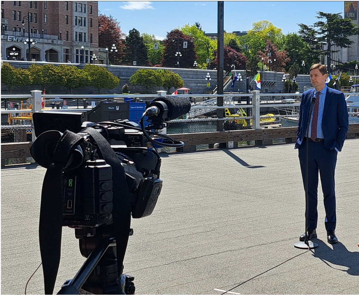
Premier David Eby faces the cameras on Ship Point Pier.