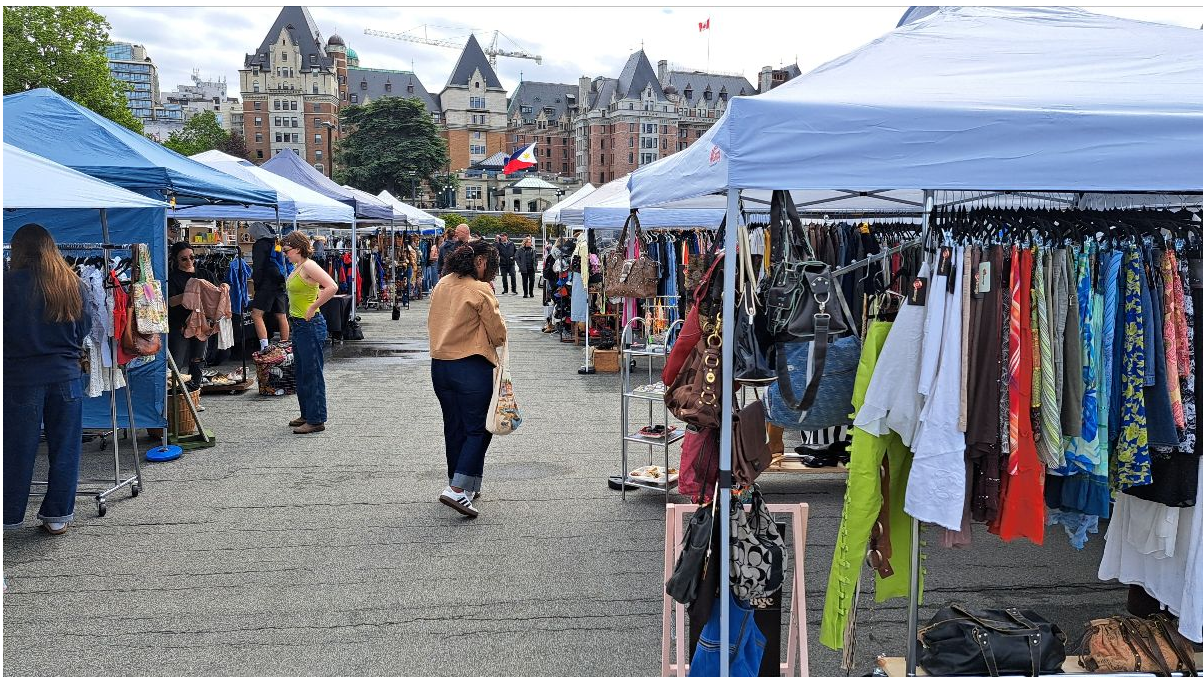
ReLove's vintage and secondhand clothing market staged on Ship Point Pier in May.

June brings another yacht race to the harbour. The Van Isle Yacht Race , known as the Van Isle 360, is a 588-nautical mile circumnavigation of Vancouver Island. It features 40 vessels and takes place over 14 days. It begins and ends in Nanaimo. Yachts will moor at the Causeway Marina between June 11 and 13.