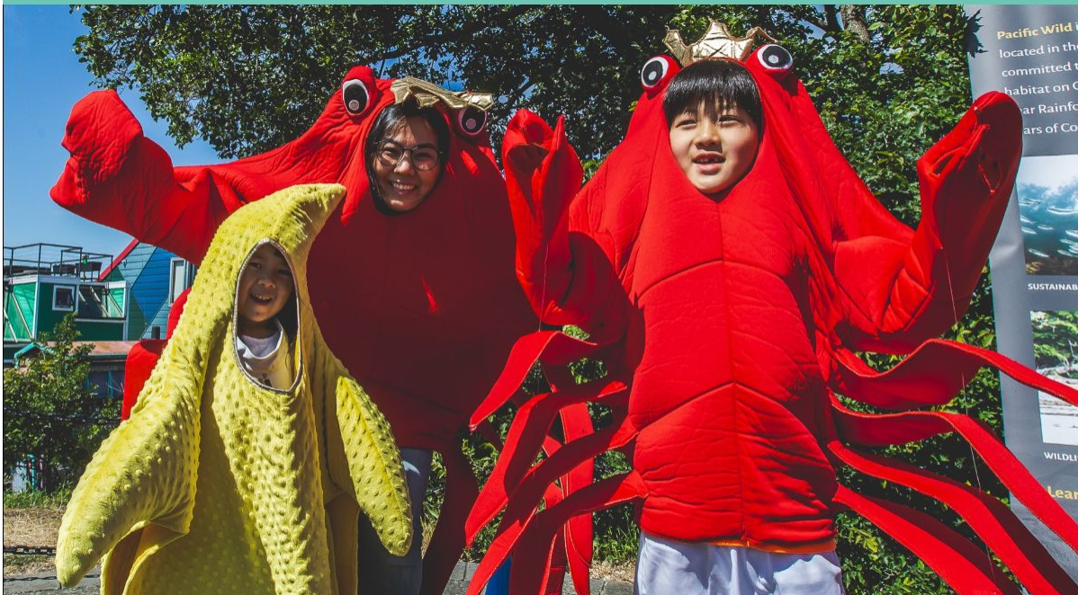
Children in costume at the 2024 World Ocean Day event at Fisherman's Wharf.