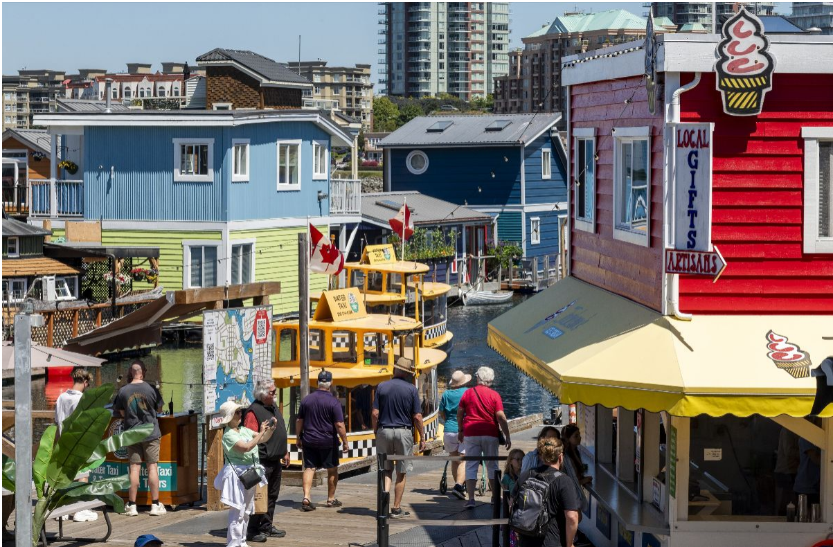
Visitors browsing the attractions at Fisherman's Wharf.