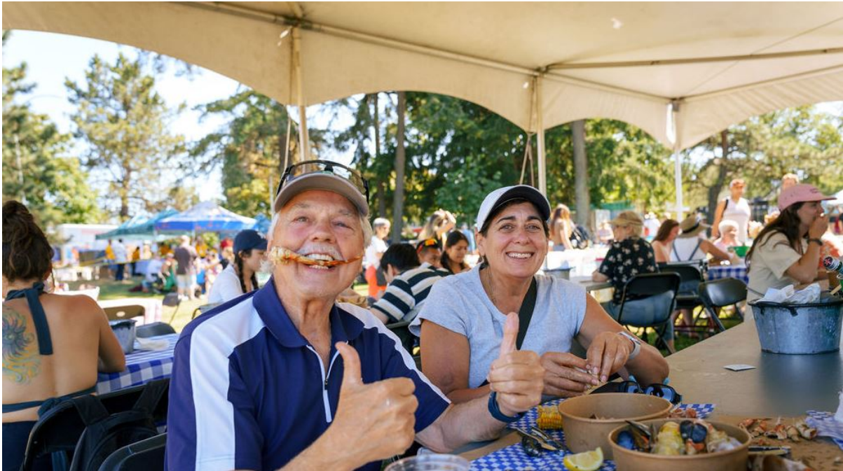
Diners enjoying a feast at CrabFest in 2024.

In addition, ReLove's vintage and secondhand clothing market will return to Ship Point on Sat, June 7, Sun, July 20, and Sun, Sept 6. Visit GVHA's events calendar for details.