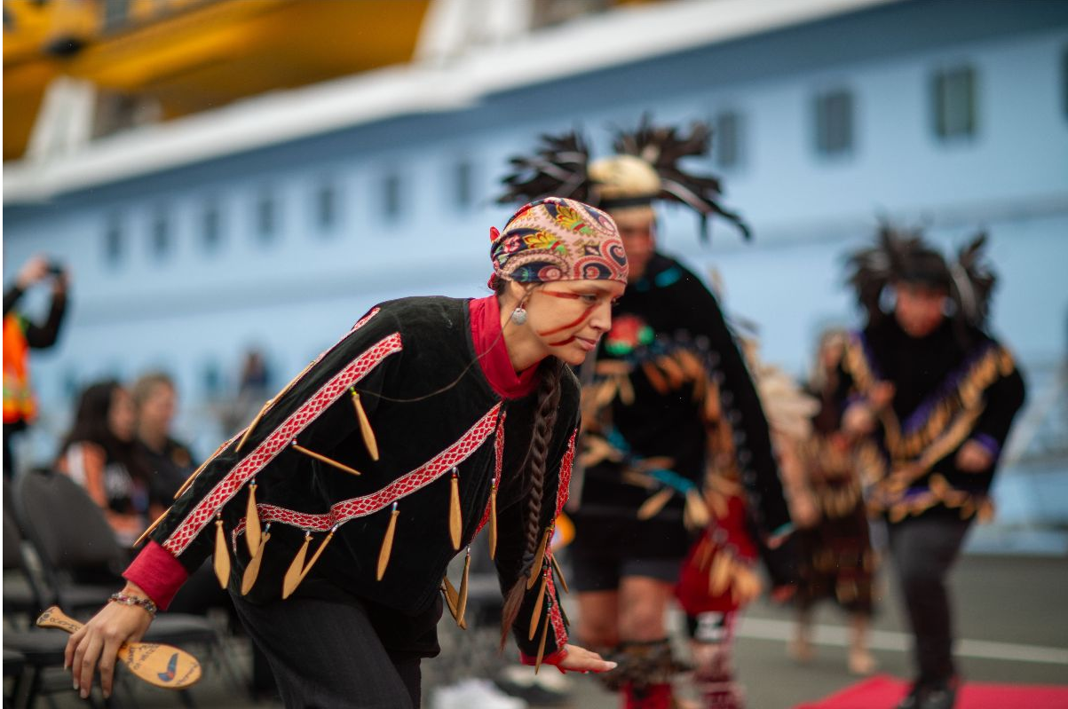
A member of the Ləkʷəŋən Traditional Dancers in front of the Anthem of the Seas.

Nearly 30 local organizations will join us, including Pacific Wild, Ocean Networks Canada, Peninsula Streams Society, Shaw Centre for the Salish Sea, the Canadian Orca Rescue Society, and Royal Canadian Marine Search & Rescue. Visit our World Ocean Day page for the event schedule and full list of participants.